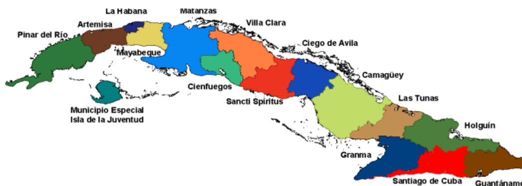
Figure 1: Provinces in Cuba

Cuba is divided into 15 provinces and one special municipality (Isla de la Juventud). Based on the preliminary data from the national census of population and housing carried out in 2012, the country has a population of 11,163,934 inhabitants most of whom live in urban areas (75.8%). The provinces with the highest population density are Havana (capital) with 2,154,454 inhabitants, followed by the eastern provinces of Santiago de Cuba and Holguín with more than one million inhabitants. The rest of the provinces have between 350,000 and 850,000 inhabitants.