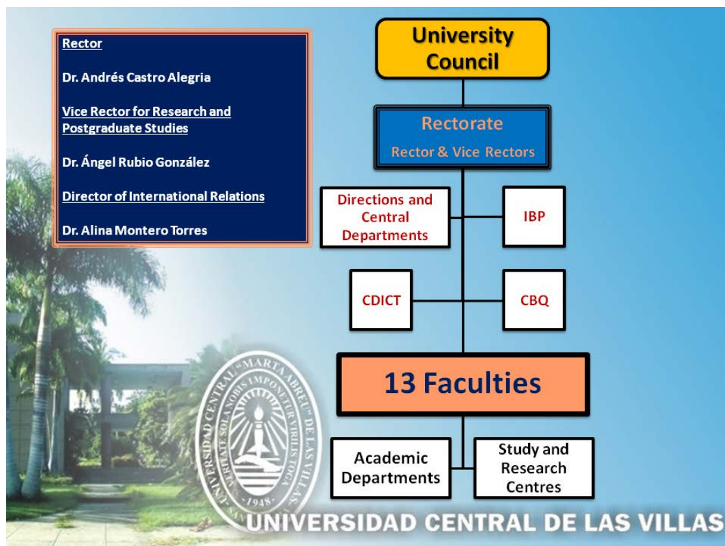
Figure 3: Structure of the university

The keywords of the mission statement of UCLV are: integral training, postgraduate education and relevant sustainable research, making it clear that UCLV is explicitly involved in the development of the country. All undergraduate and postgraduate education, as well as all the research conducted, is related to the social and economic development of Cuba. At present, four key areas have been defined within the UCLV strategic plan: